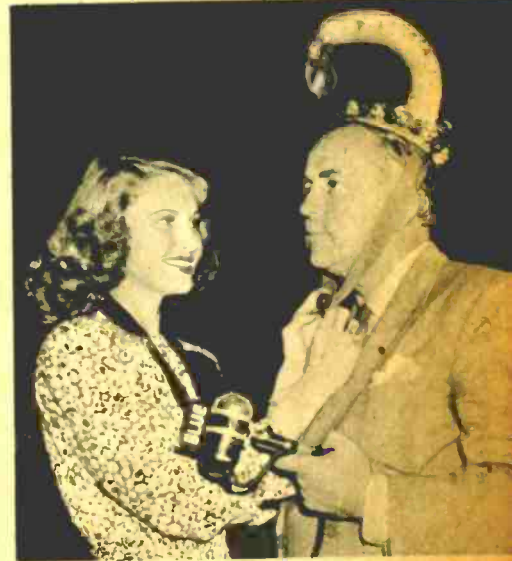
▲ A HORN OF PLENTY HAT —and plenty of beauty to go with it in luscious June Lang, another guestar of Sardi's.