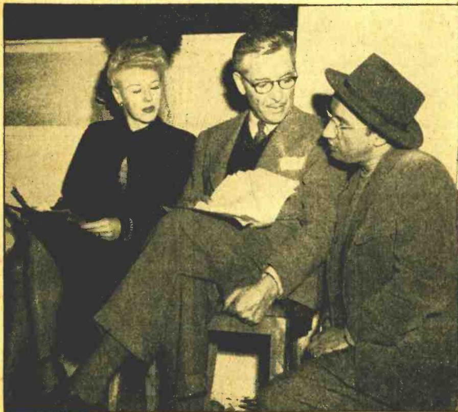
WORLD PREMIERE OF NEW SHOW —Pictured are Ginger Rogers, Ronald Colman, and Arch Oboler, consulting on script of "Everything for the Boys," new dramatic series which debuted January 18 on NBC-KFI. Each week Oboler will adapt well-known dramas, dictated by poll of servicemen, as starring vehicle for Colman. Feminine guest stars will be changed each broadcast, according to script requirements.